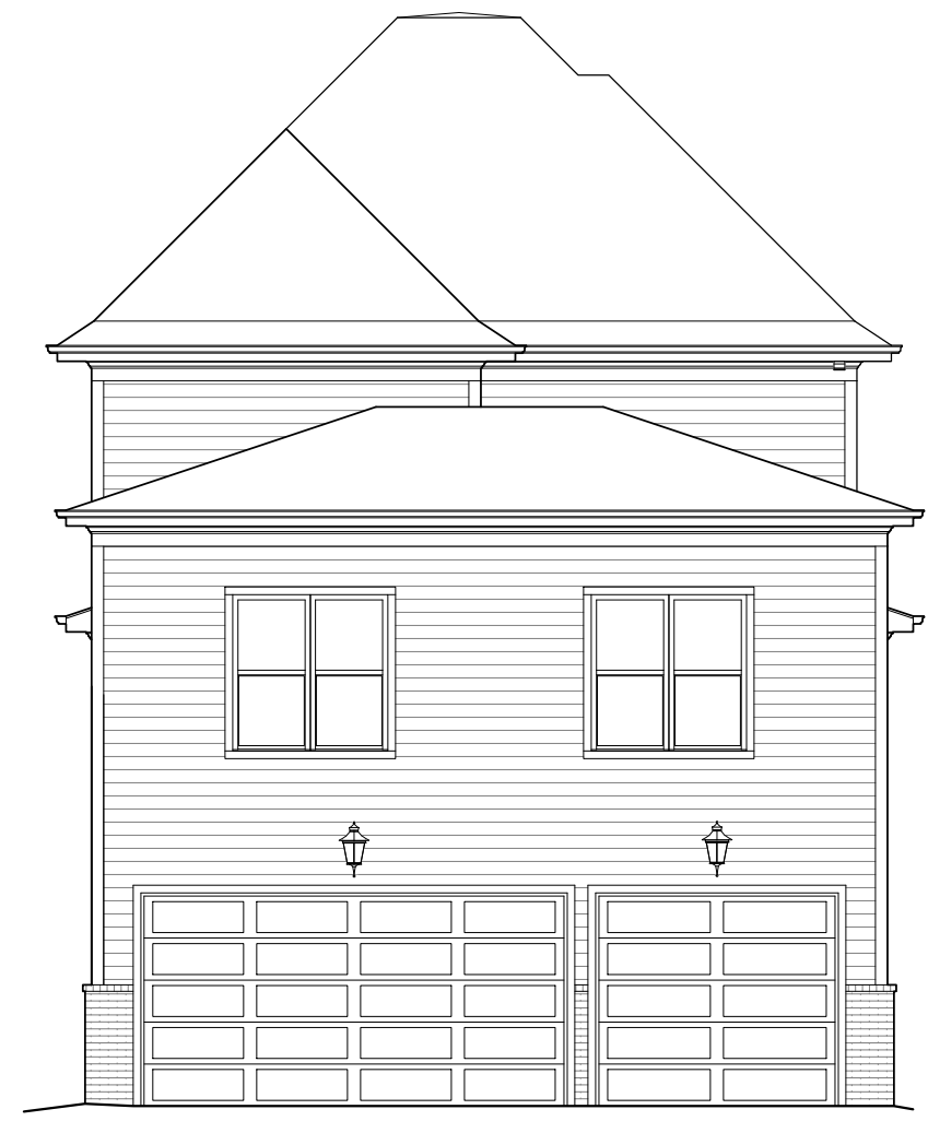
2 REAR ELEVATION 1/8" = 1'-0"