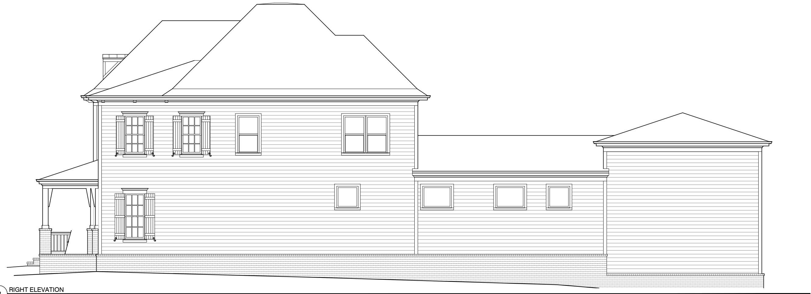
2 RIGHT ELEVATION 1/8" = 1'-0"