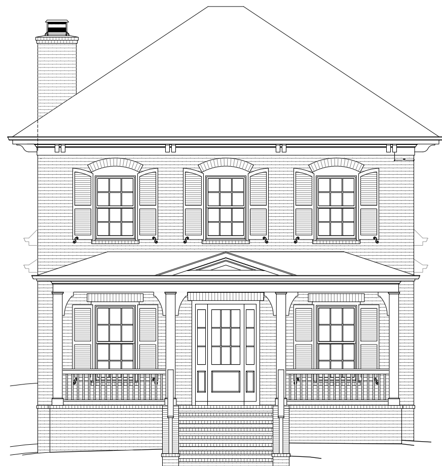
1 FRONT ELEVATION 1/8" = 1'-0"

WESTHAVEN LOT 2418 1049 WILLIAM STREET CAMILLE 41