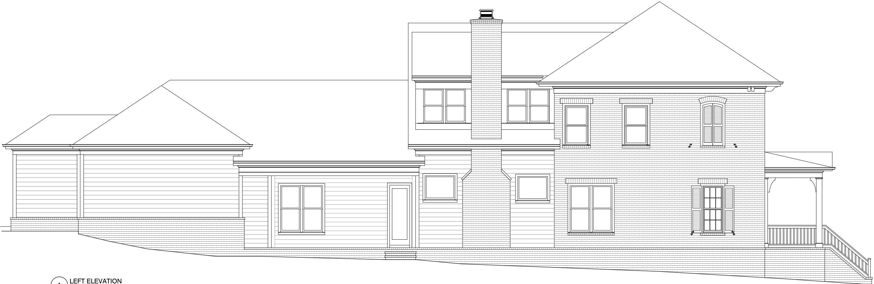
1 LEFT ELEVATION 1/8" = 1'-0"