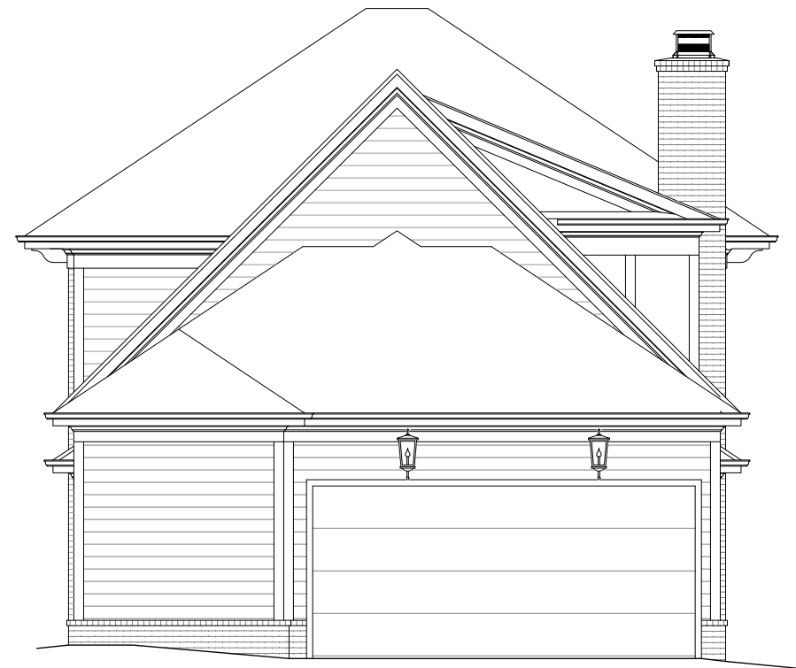
2 REAR ELEVATION 1/8" = 1'-0"