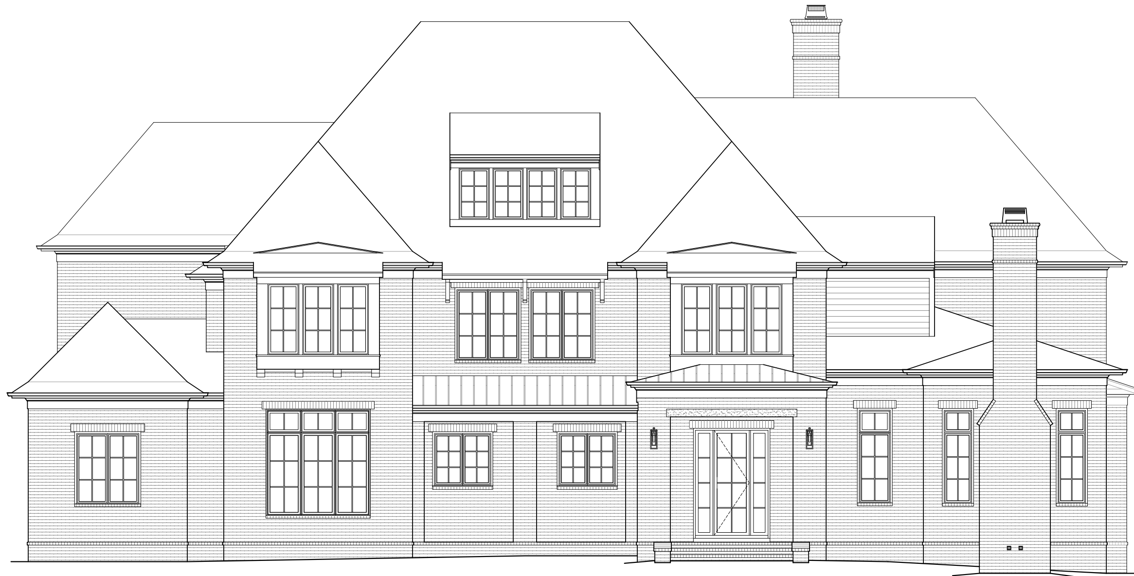
1 FRONT ELEVATION 1/4" = 1'-0"

ROSEBROOKE LOT 034 1669 HEARTWOOD LANE CHARLOTTE