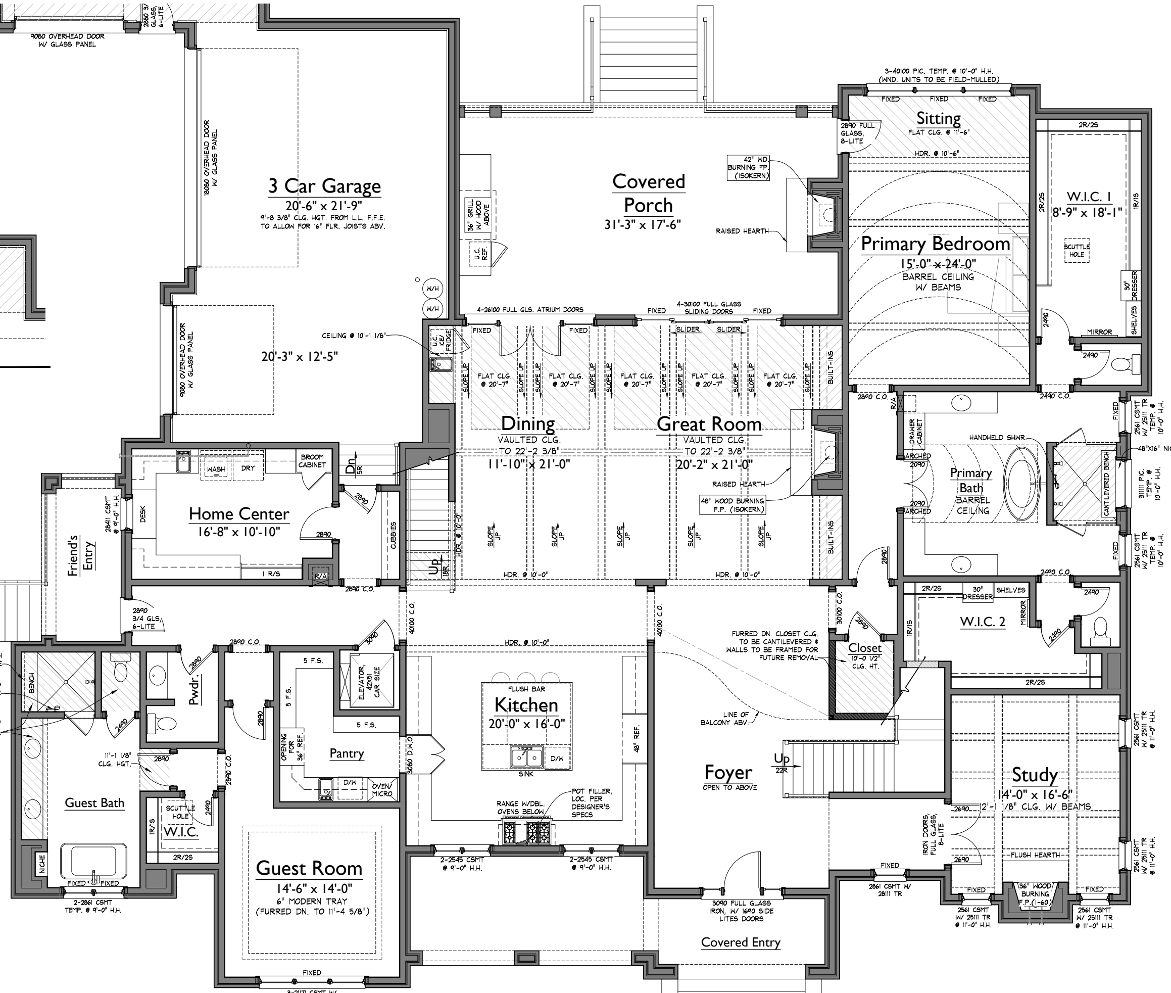
1 LOWER LEVEL FLOOR PLAN 1/4" = 1'-0"