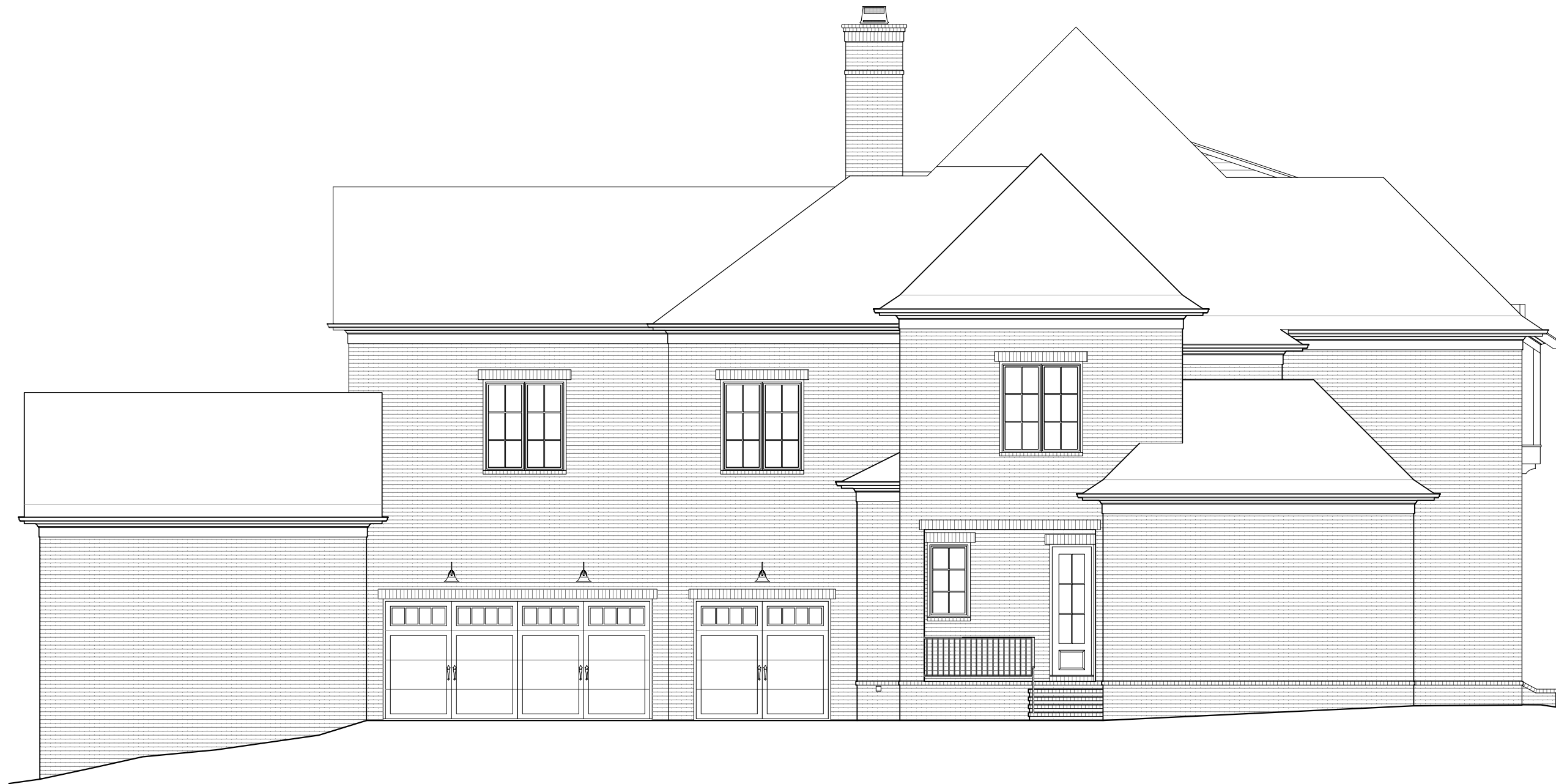
1 LEFT ELEVATION 1/4" = 1'-0"

ROSEBROOKE LOT 034 1669 HEARTWOOD LANE CHARLOTTE