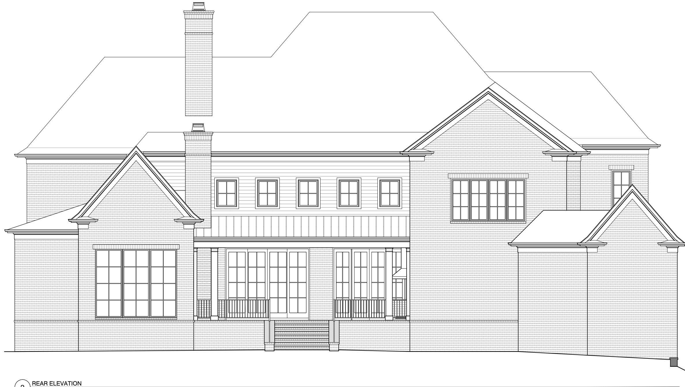
2 REAR ELEVATION 1/4" = 1'-0"

ROSEBROOKE LOT 034 1669 HEARTWOOD LANE CHARLOTTE