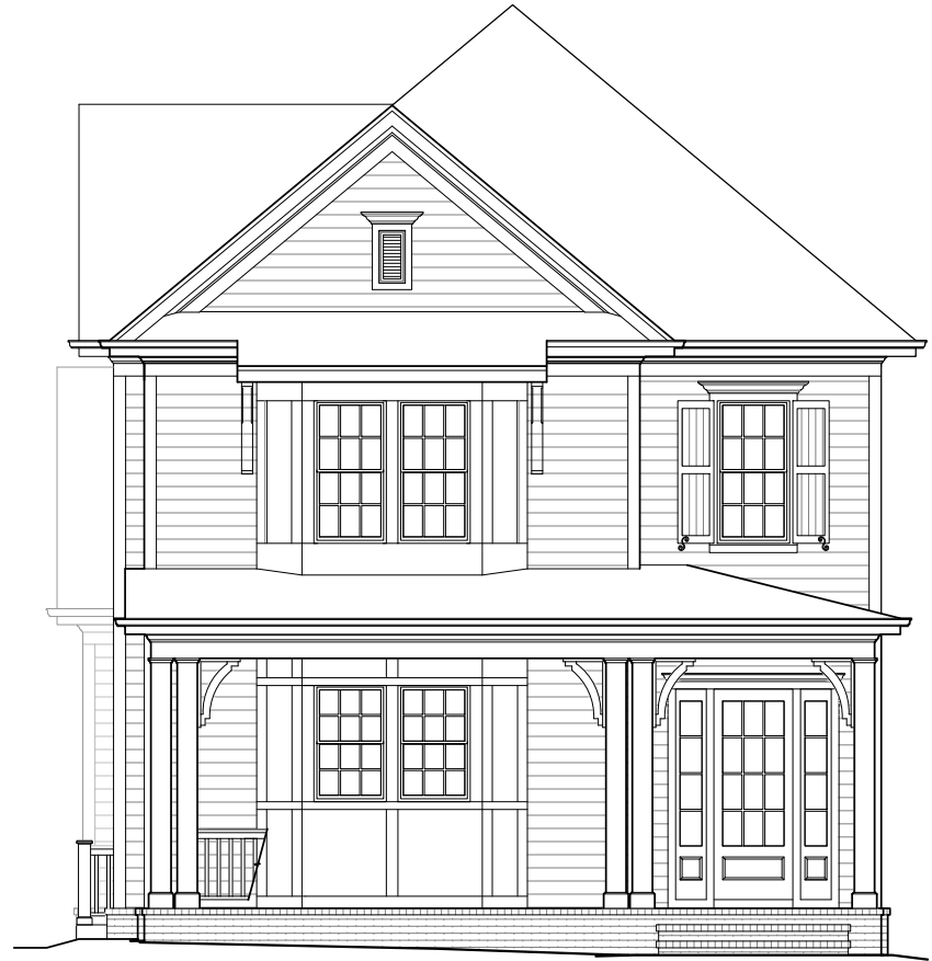
SV050_hazeSV41_AI15-ss 1 FRONT ELEVATION 1/8" = 1'-0"