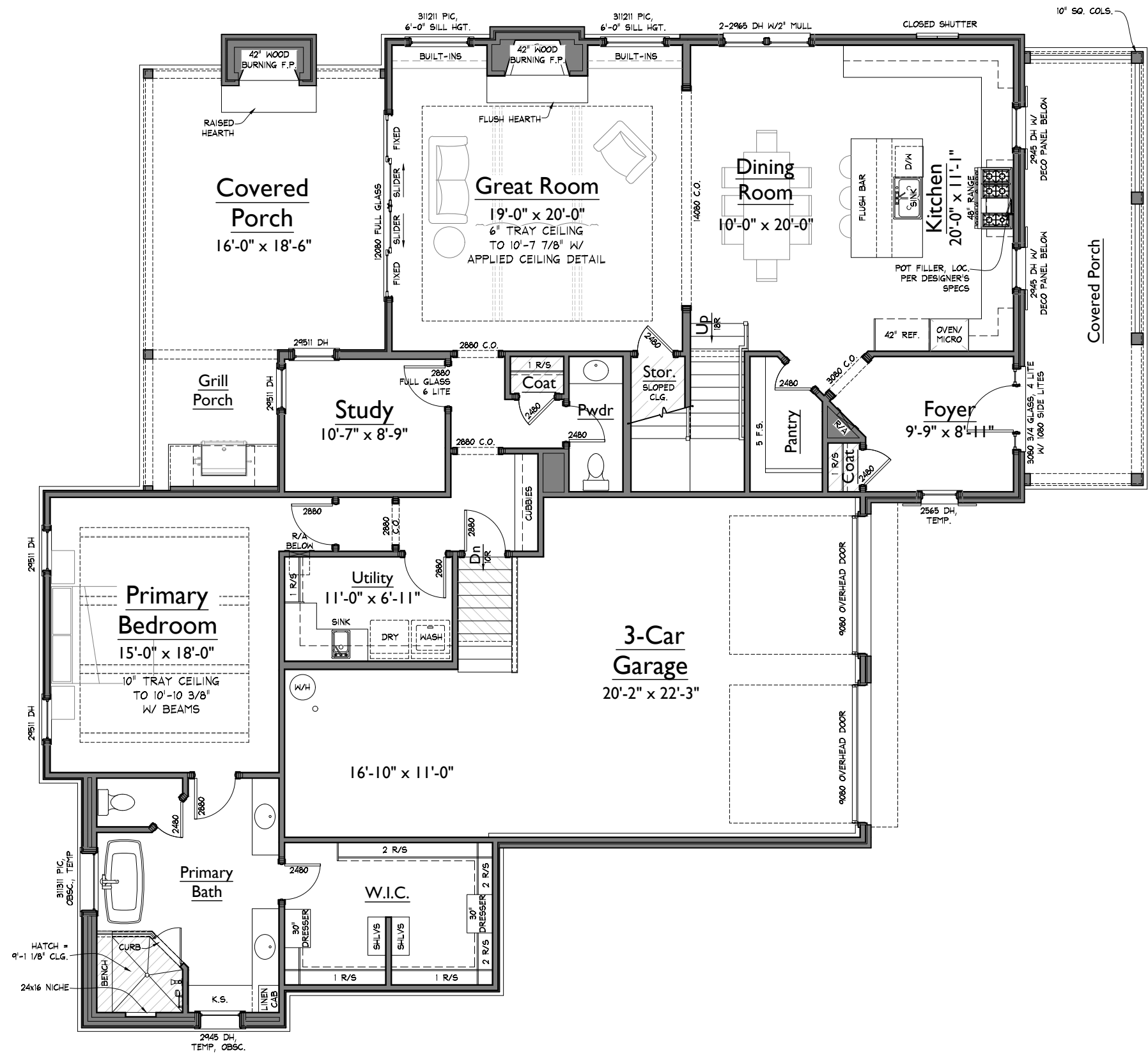
1 LOWER LEVEL FLOOR PLAN 1/8" = 1'-0"

S:\Projects\Westhaven\Sec 63\WH2649_HazeSB60\FP01.dwg, Julie.pgn, 05/20/26 - 3:51 P